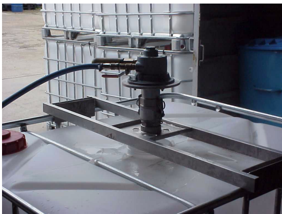
Air driven mixer motor with bridge assembly

Pensteel is one of the premier companies supplying IBCs to the Chemical, Paint, Food and Pharmaceutical industries. Along with IBCs, we are able to offer a mixing facility for use within the Schütz range of containers.