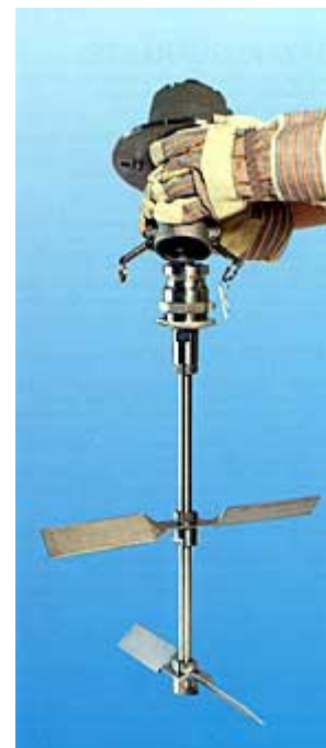
Demountable mixer from shaft and paddle assembly