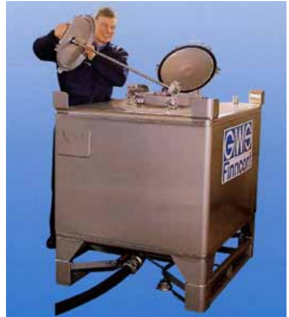
Shaft and ring propeller assembly fixed to a manhole cover