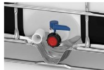
Integrated butterfly valve DN 50 with operating lever and screw cap