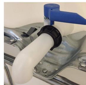
Integrated butterfly valve DN 50 with outlet nozzle